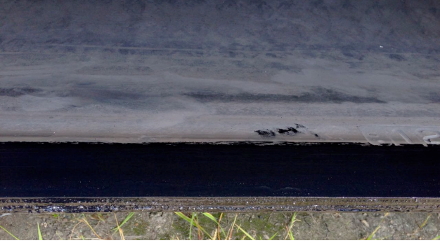
The edge has been resealed

For more information on any of our products or services, please contact either our Newcastle or Sydney offices on: T: + 61 400 386 239 or + 61 414 248 855 www.cobond.com.au