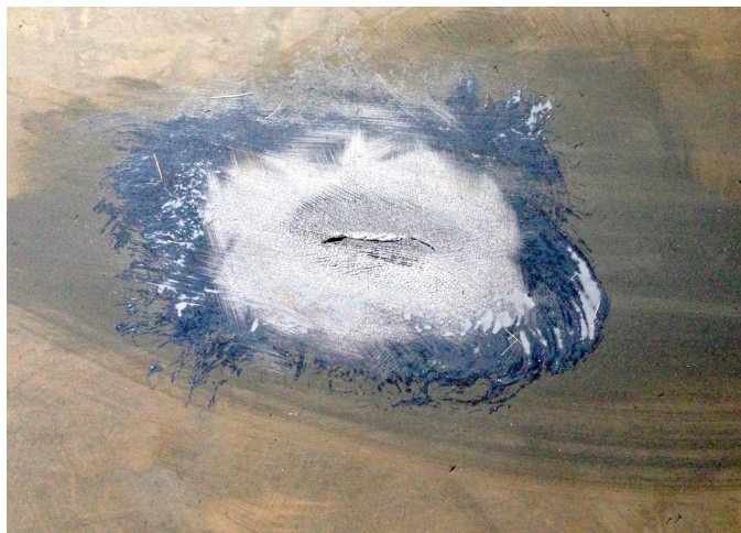
An example of the spot repair (primed)

The repair was completed saving time and considerable cost and the belt was available for use at the completion of the shut down. There have been no issues with the repairs following the belt returning to full service.